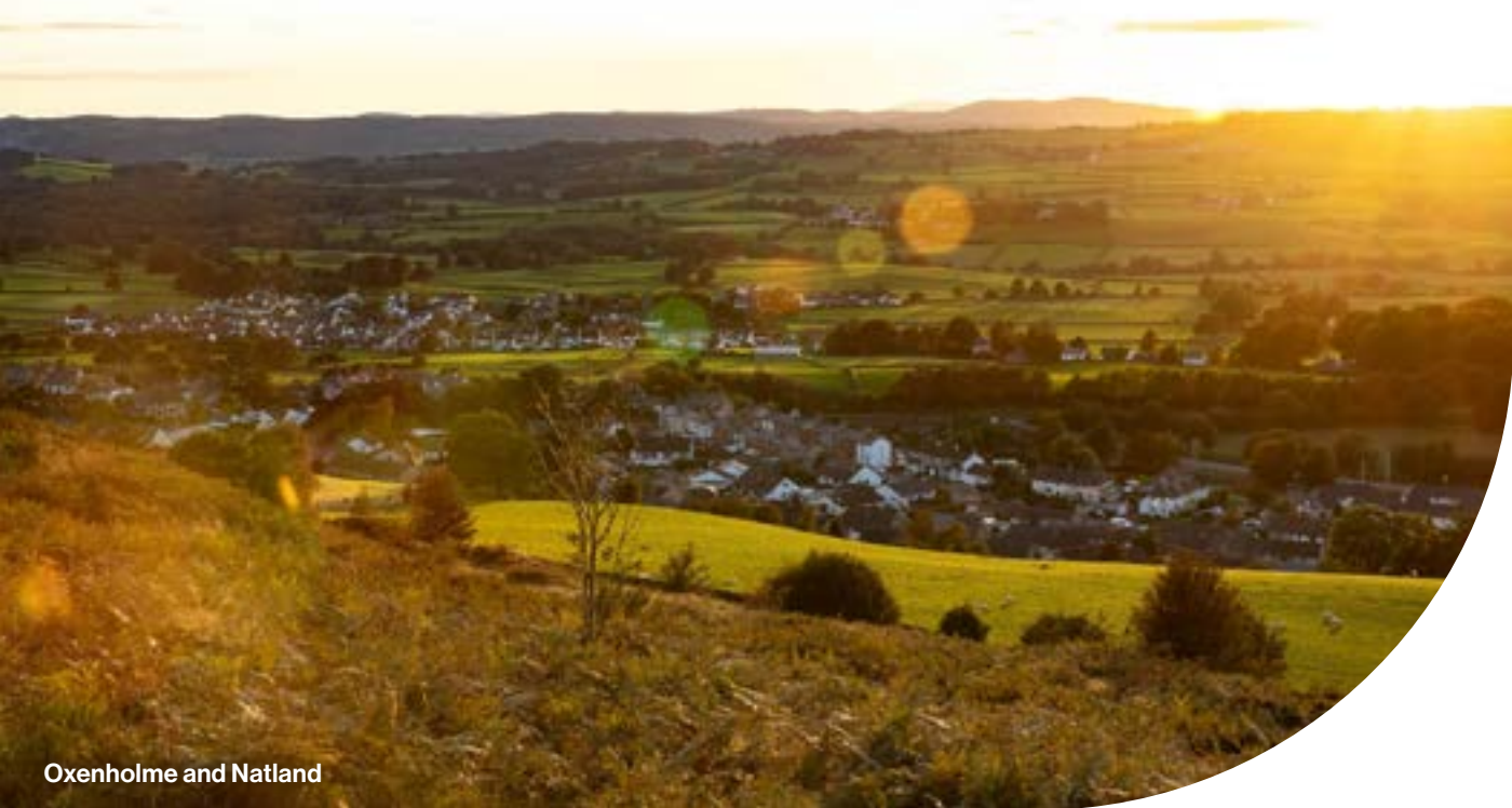
Oxenholme and Natland

Our 10 change programmes split into two groups: